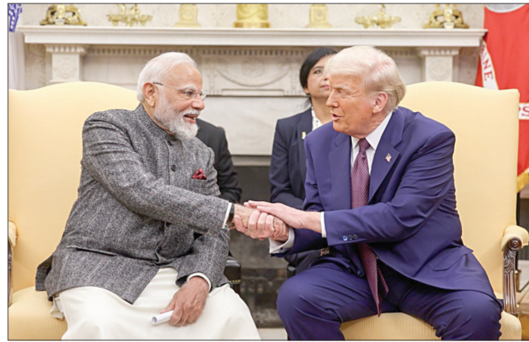
In this handout image, Prime Minister Narendra Modi with US President Donald Trump during a meeting at the White House, in Washington, DC, USA.

MI News Service, Washington (DC) : Prime Minister Narendra Modi has coined a new term 'Make India Great Again' (MIGA) inspired by President Donald Trump's motto 'Make America Great Again' (MAGA) and said the two visions together form the "MEGA partnership for prosperity" and gives new scale to bilateral partnership.