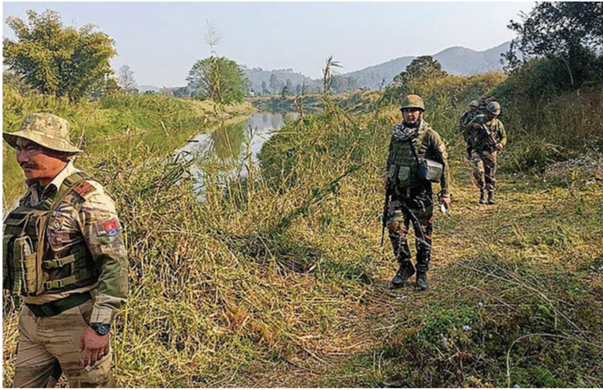
In this image released by @manipur_police via X, Security personnel conduct a search operation in the fringe and vulnerable areas of hill and valley districts of Manipur.

The IAEA shared on social media that an unmanned aerial vehicle (drone) had struck the roof of the confinement, leading to the explosion and fire.