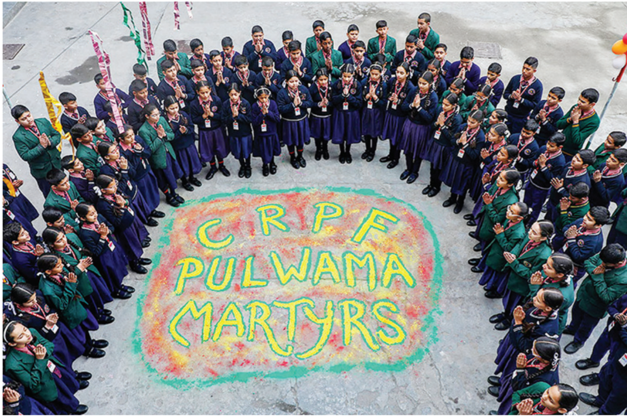
School students pay tribute to the martyred soldiers of 2019 Pulwama terror attack, in Jammu.