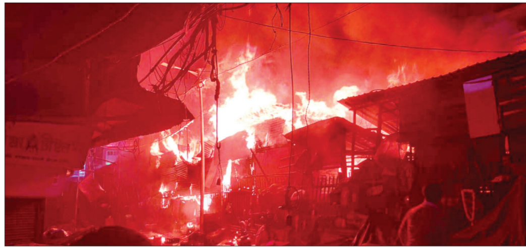
(Right) A fire breaks out in the Sealdah area of Kolkata on Thursday night. (Left) Shopkeepers and residents inspect the shops and surrounding area after the fire is brought under control in Sealdah, Kolkata, on Friday.

Over the next 15 days, police apprehended a total of 46 fraudsters, who were collectively responsible for scams worth several crores of rupees.