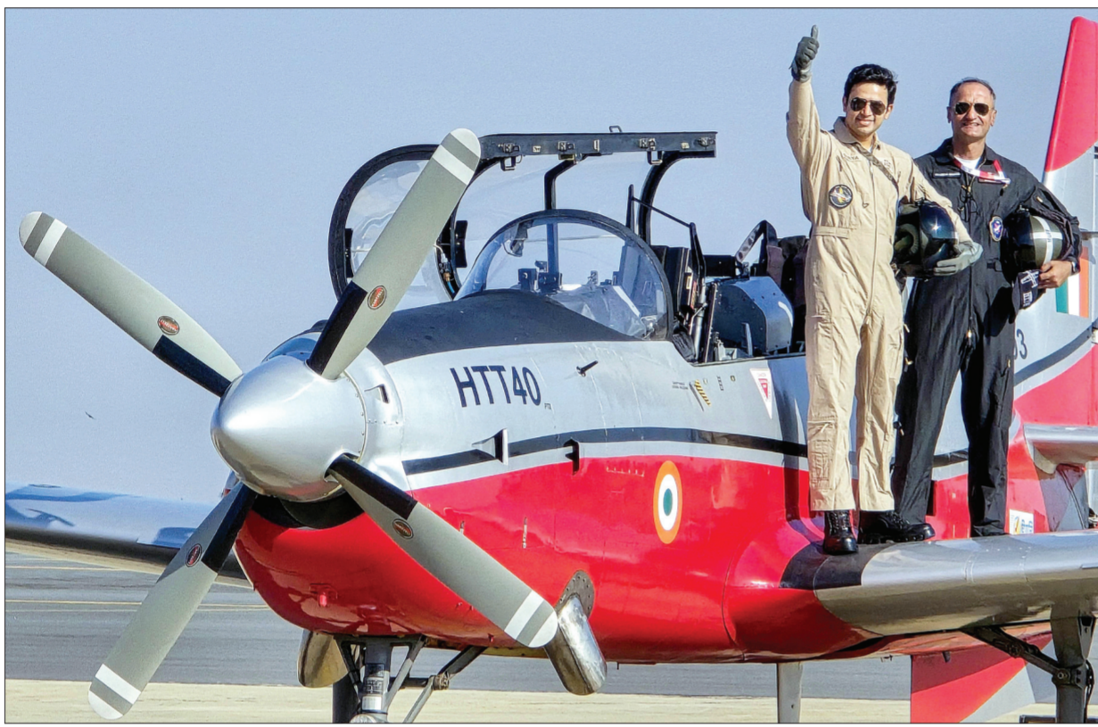
Bharatiya Janata Party (BJP) MP Tejasvi Surya takes a sortie on HTT-40 Trainer Aircraft at 'Aero India 2025', at Yelahanka Airforce station in Bengaluru on Thursday.

Revenue expenditures of an organisation are short-term expenses used to service its ongoing operational costs, including salaries of employees, overhead costs and financing welfare schemes, while capital expenditures (capex) are funds used for one-time creation of fixed assets that are expected to generate revenue over a longer period.