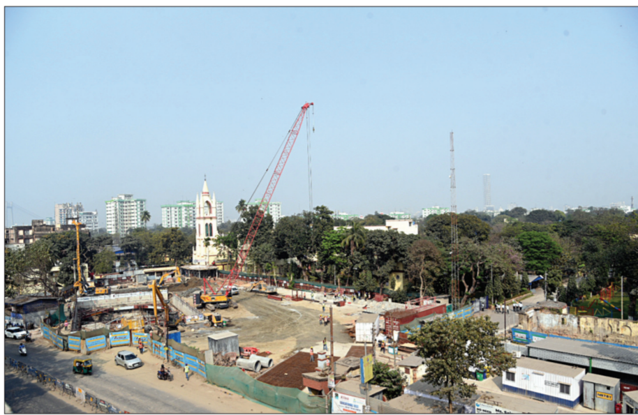
Joka-BBD Bag Metro rail work in progress at Khidderpore, Kolkata.

As debates over the budget continue, the TMC leader's statements add to the growing discourse on whether the Union Budget truly benefits the middle class or simply shifts the tax burden through indirect means.