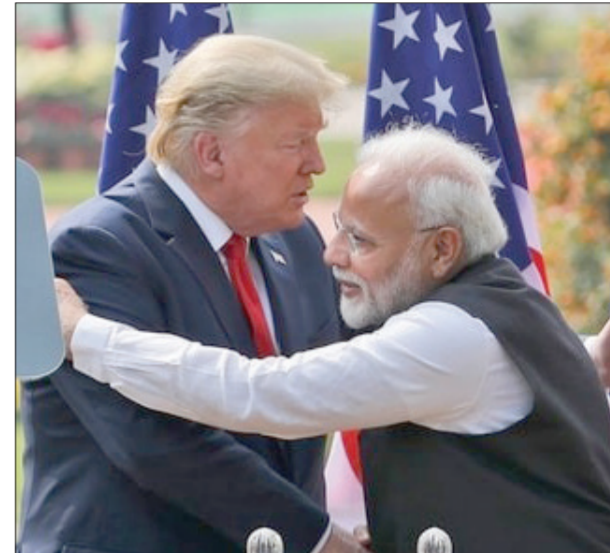
Prime minister Narendra Modi hugs US President Donald Trump as the two leaders meet in the White House on Thursday.