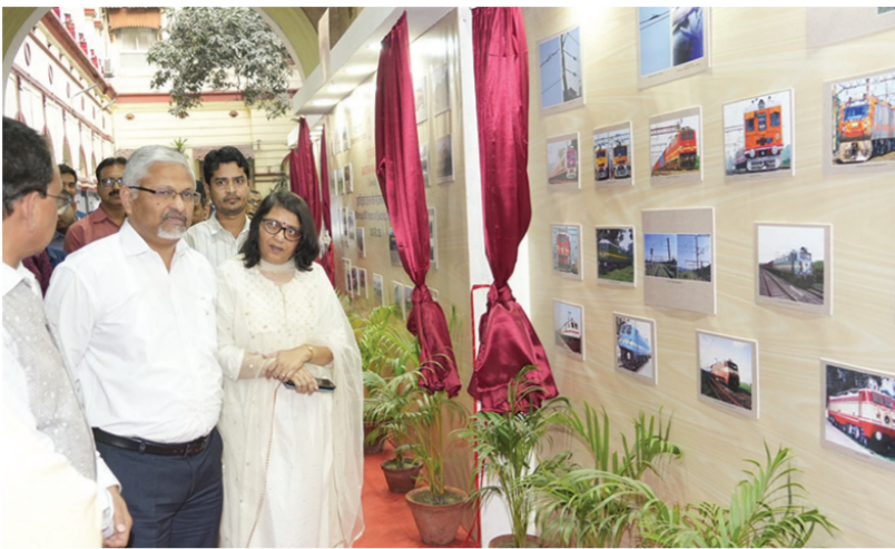
Photo Exhibition at ER headquarters on completion of 100 Years of Electric Traction opened by GM

MI News Service, Kolkata: As a part of Centenary Celebration on Completion of 100 Glorious Years of Electric Traction over Indian Railways, a photo exhibition has been organized at Eastern Railway Headquarters depicting the significant transformation of Indian Railways with the introduction of electric traction. This vibrant