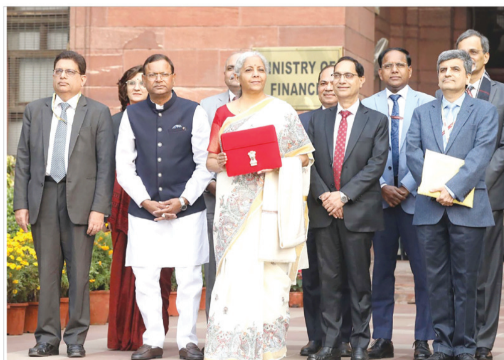
"Currently, only 2.5% of the population pays taxes, indicating a significant opportunity for growth. While the budget has been praised for its focus on affordable housing, more needs to be done to achieve the $5 trillion target before 2026."