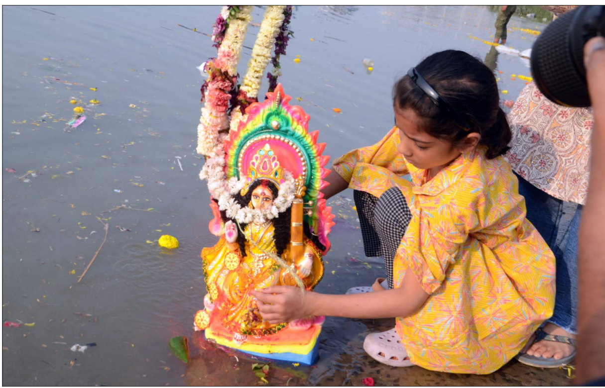
The immersion of Goddess Saraswati's idol at Bahughat in Kolkata on Tuesday.

MI News Service, Kolkata: In 1975, with just 17 students, an English-medium school named Rasa Shishu Sandipak KG was established at Wireless Park in Tollygunge. Later, under the supervision of Bharat Sevashram Sangha, it was transformed into Swami Pranabananda Vidyapith. The school was upgraded to a junior high school in 1998 and to a higher secondary school in 2002. Currently, this institution, managed by Bharat Sevashram Sangha, has 150 teachers and staff members and 3,500 students.