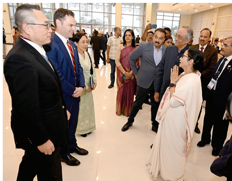
West Bengal Chief Minister Mamata Banerjee, accompanied by Principal Chief Advisor to the Chief Minister and Finance Department Amit Mitra, warmly welcomes foreign delegates and representatives at a high tea event held at Eco Park, setting the stage for the Bengal Global Business Summit (BGBS) on Tuesday.

As the Business Summit will officially begin on Wednesday, Mamata Banerjee once again said that she last spoken to the King in October, and as far as she knew, he was scheduled to arrive in Kolkata on Wednesday morning. "However, now I'm told that there might be some problems related to Delhi. But I don't know the full details, so I can't comment further. I hope he comes. His