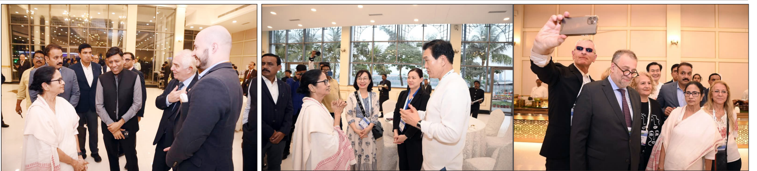
West Bengal Chief Minister Mamata Banerjee spent the evening before the launch of our Bengal Global Business Summit 2025 welcoming delegates arriving in Kolkata from across the world.

CLW stands as the leading manufacturer of electric locomotives for Indian Railways on Tuesday. Its contributions are essential to the modernization of the railway system and India's transition to a more sustainable and efficient transport network.