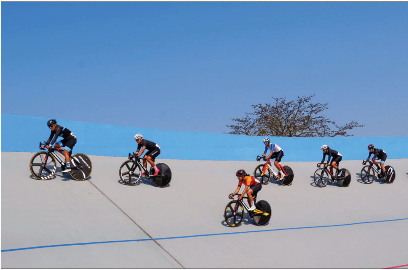
Cyclists participate in a cycling race during the 38th National Games, at Velodrome of Rudrapur Sports Stadium in Udhm Singh Nagar on Tuesday.