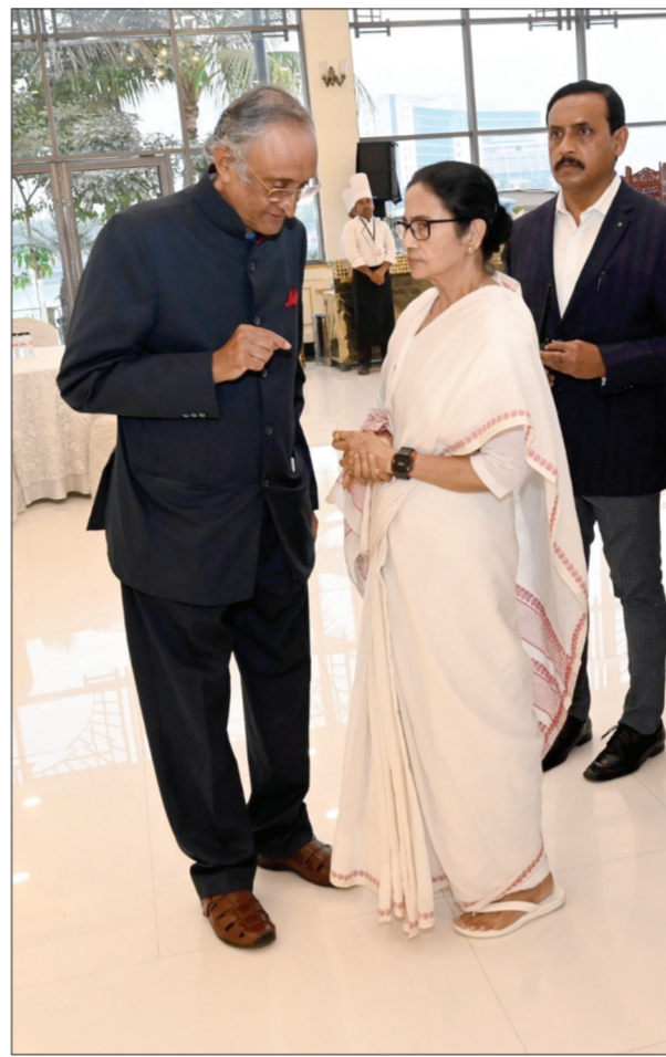
West Bengal Chief Minister Mamata Banerjee and Principal Chief Advisor to the Chief Minister and Finance Department Amit Mitra engage in conversation during a high tea event at Eco Park, ahead of the Bengal Global Business Summit (BGBS) on Tuesday.

Manhole construction was underway when the fatal incident claimed the lives of three workers on Sunday. Following their deaths, authorities have halted all work indefinitely. Investigators are also looking into how tannery effluents entered the new drainage system, as chemical-laden wastewater is believed to have created toxic gases that proved fatal. KMDA has now declared that no further development work will take place until this issue is fully addressed.