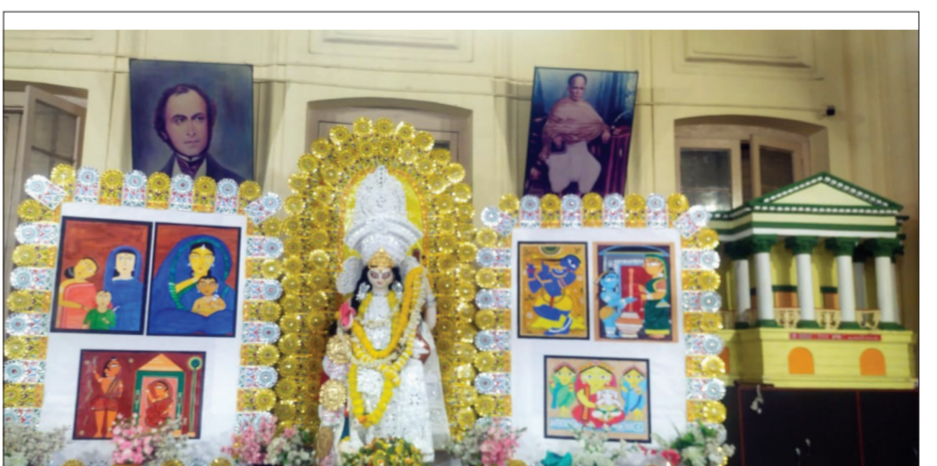
175th Saraswati Puja at Bethune Collegiate School.

To escape the attacks, the elephant went into a tea plantation, but got injured by blade-wire fences and returned to the field again. Seeing the elephant returning, some people climbed onto a watchtower.