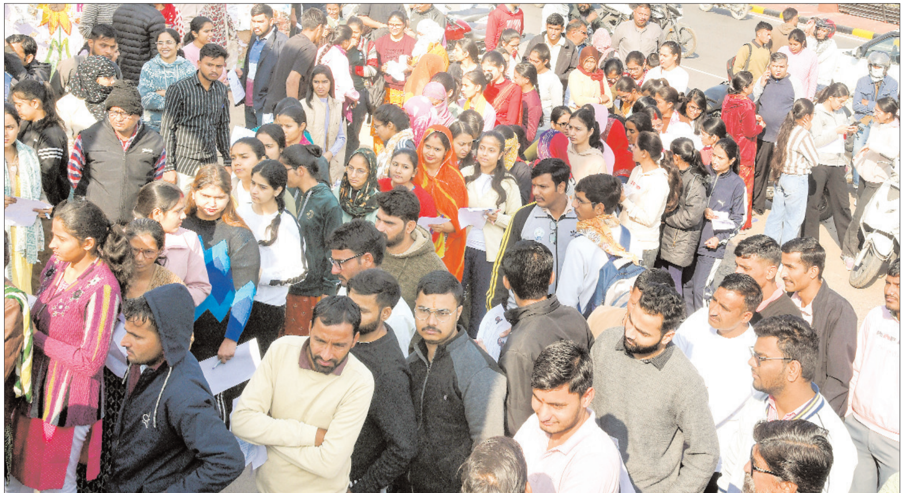
Candidates wait in queues before entering the examination centre to appear in the Rajasthan Administrative Services (RAS) 2025 prelims exam, in Bikaner on Sunday.

The writer is a blogger Contact: adityavashisht07@gmail.com Mob-Whatsapp: +91-77-5500-5600