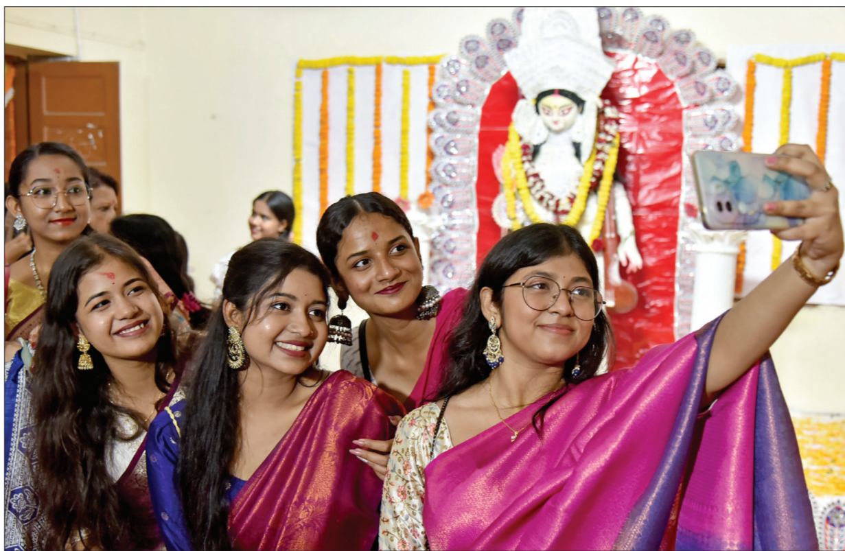
Students in 'selfie-mode' during Swaraswati Pujo celebration in Kolkata on Sunday.

From PG 1 investors would desire to have in the actions and assurances" of the administration, the Jan. 29 court filing states. The Indian finance ministry and the customs official who issued the demand order did not respond to requests for comment outside regular business hours. Volkswagen's India unit said in a statement it is using all legal remedies as it cooperates with authorities and remains committed to ensuring "full compliance" with all global and local laws. A Volkswagen spokesperson in Germany did not respond to a request for a comment. The German carmaker is a tiny player in India's 4 million units a year car market, the world's third biggest, where its Audi brand also lags competitors in the luxury segment like Mercedes and BMW. A government source earlier told Reuters that with penalties, Volkswagen India may have to pay about $2.8 billion if it loses the dispute. In 2023-24, VW India reported sales of $2.19 billion, and a net profit of $11 million.