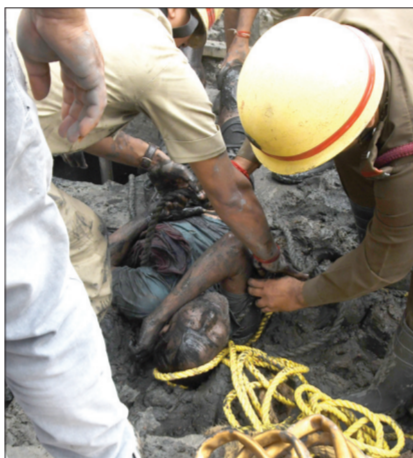
3 workers died in an accident at Bantala Leather Complex in Kolkata on Sunday.

MI News Service, Kolkata: Three labourers found dead after falling deep inside a drain while clearing the man-