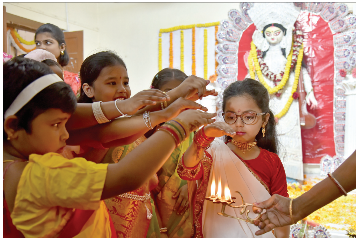
Students from junior classes seen deeply engrossed in Pujo rituals during Swaraswati Pujo celebration in Kolkata on Sunday.