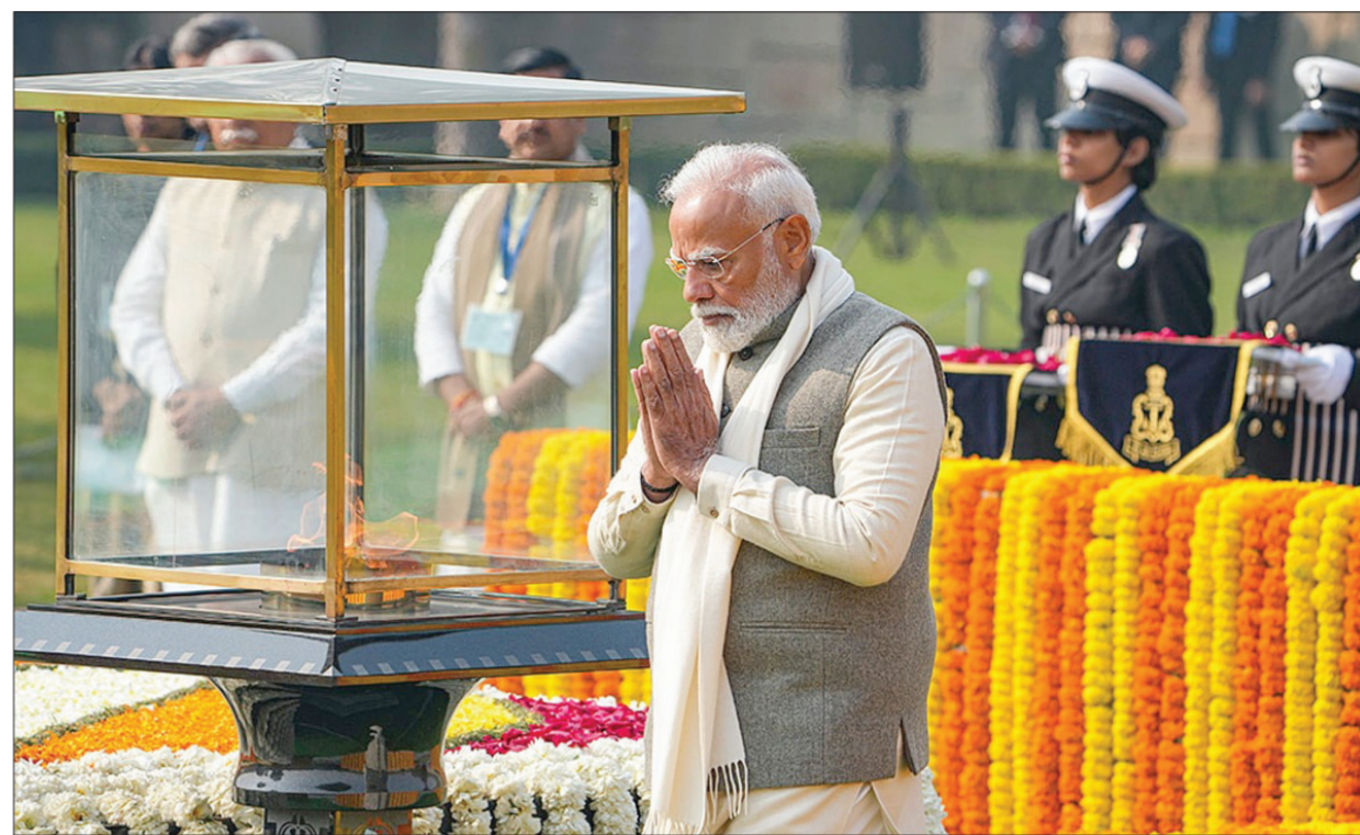
Prime Minister Narendra Modi pays homage to Mahatma Gandhi on Martyrs' Day, observed to mark the death anniversary of the father of the nation, at Rajghat, in New Delhi.

Additionally, after a parliamentary party meeting, an organizational meeting is also likely to take place in the last week of February. The meeting, expected to be held at Netaji Indoor Stadium, will be attended by TMC leaders, ministers, and public representatives from various levels of the party. While the final date for this meeting has not yet been confirmed, it will serve as an important occasion to discuss party matters in light of the upcoming elections. Given the political importance of the session and the ongoing preparations for the next election, the TMC legislature group's meeting will likely set the tone for the party's strategy during the budget session and in the months leading up to the election.