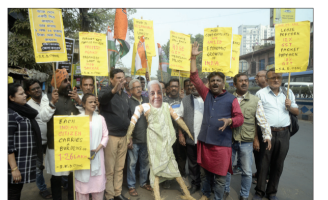
Congress activists take part in a demonstration to protest against anti people's budget and economic policy, in Kolkata.