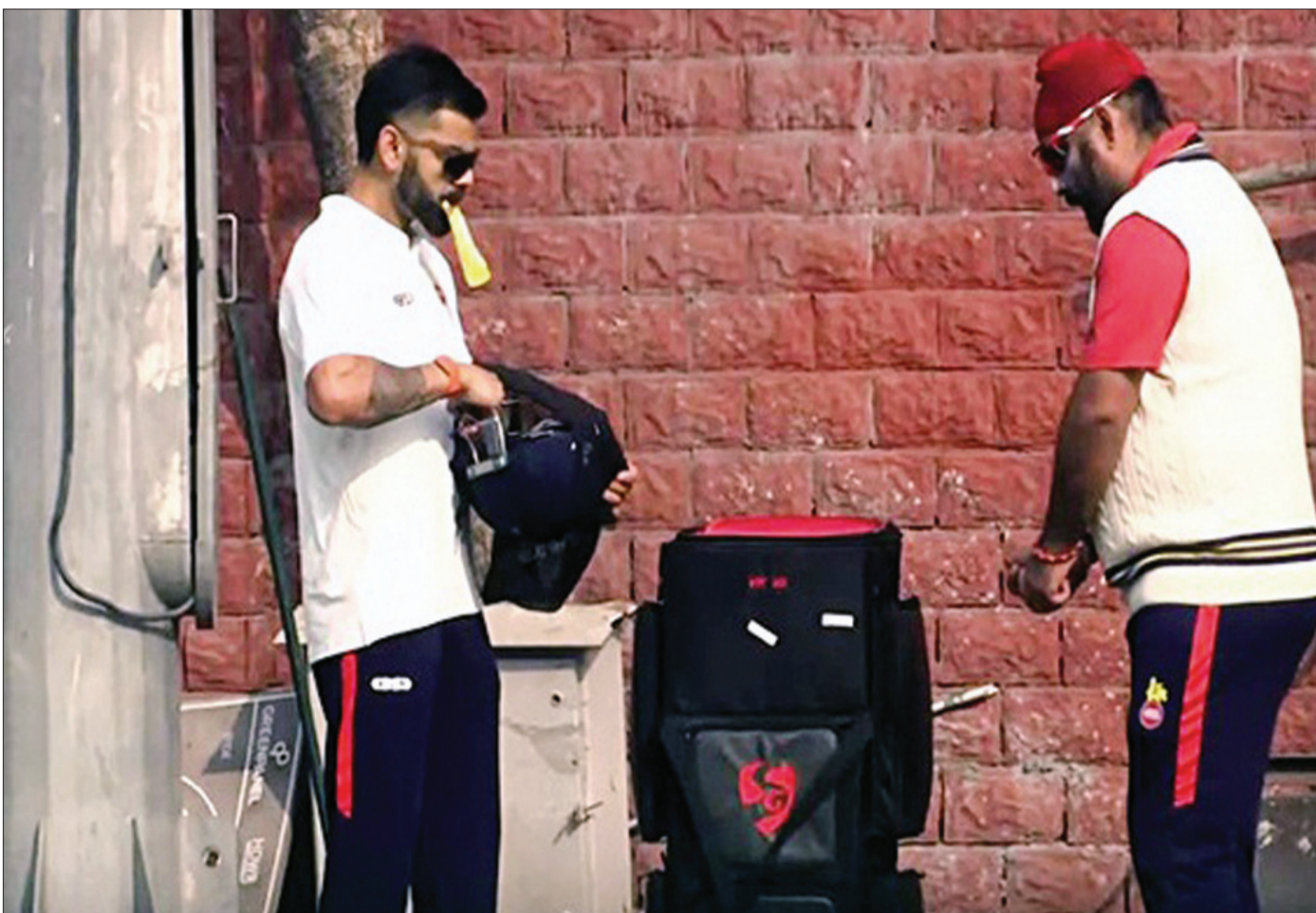
Virat Kohli during a practice session on the eve of the Ranji Trophy match between Delhi and Railways, at Arun Jaitley International Cricket Stadium, in New Delhi on Wednesday.