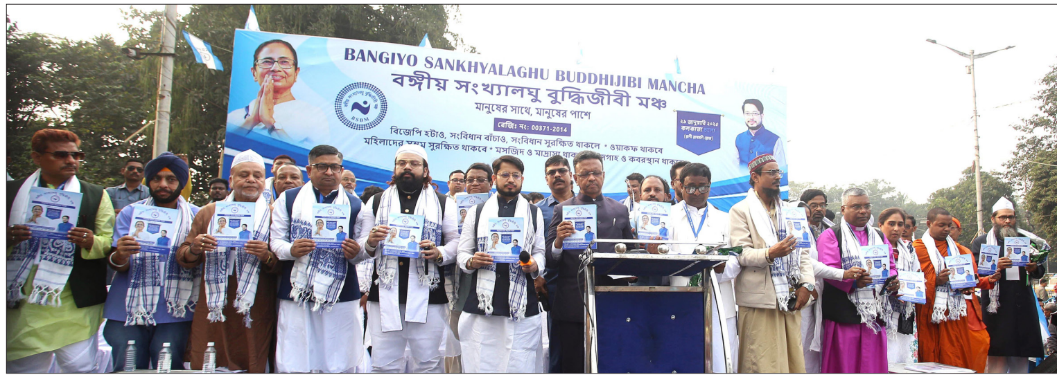
State Minister and Mayor of Kolkata Firhad Hakim at the meeting of Bangiyu Sankhyalagu Buddhijibi Mancha at Rani Rashmoni Road in Kolkata on Wednesday.