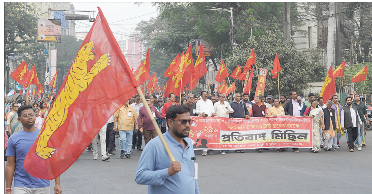
All India Forward Bloc (AIFB) Bengal Committee organizes a rally protesting against the rising prices of goods, demanding permanent jobs in government and private sectors, and promoting communal harmony. The rally commences from Mahajati Sadan to Dharamtala, in Kolkata on Wednesday.

The World Bengal Business Summit comes at a time when Bengal is looking to position itself as a leading business hub in the region. The event will focus on attracting investments from both domestic and international sources, with a special emphasis on sectors that can drive Bengal's economic growth in the coming years.