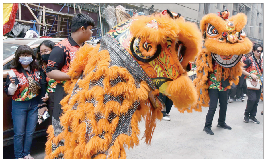
Members of the Chinese community take part in traditional dragon and lion dances on the first day of the Lunar New Year of the Snake, in Kolkata on Wednesday.

Mamata's remarks underline her discontent with Congress' role in the opposition alliance and emphasize the need for unity and proper planning to effectively challenge BJP. Her candid evaluation paints a clear picture of her frustration with the Congress and her belief that a more strategic approach was needed to defeat the BJP in national politics.