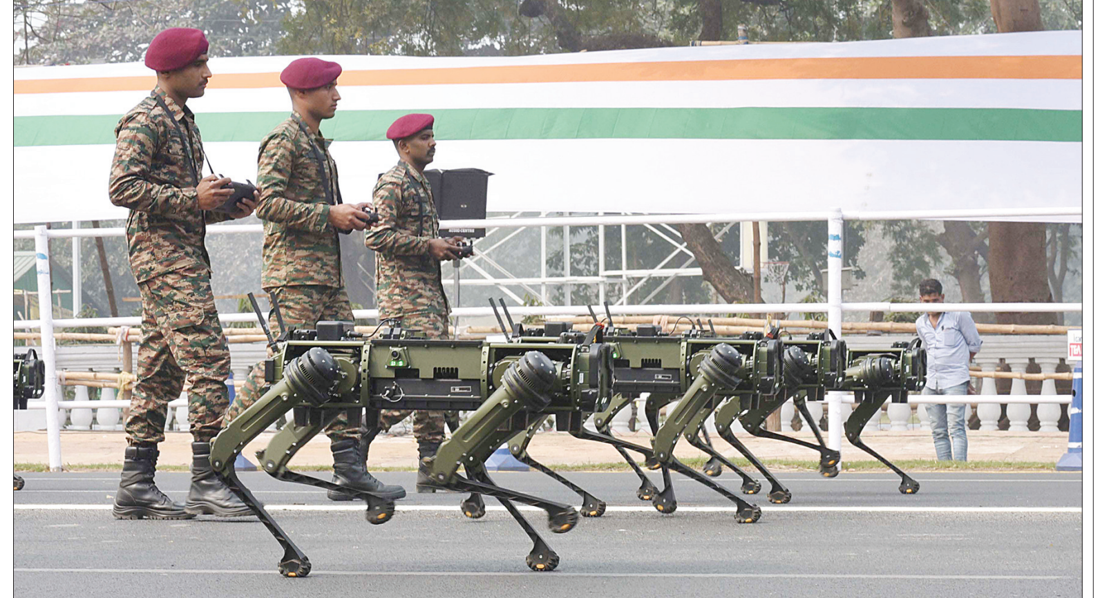
Indian army jawans introducing robot dog squad for the first time in the full dress rehearsal of Republic day on Red Road in kolkata on Friday.