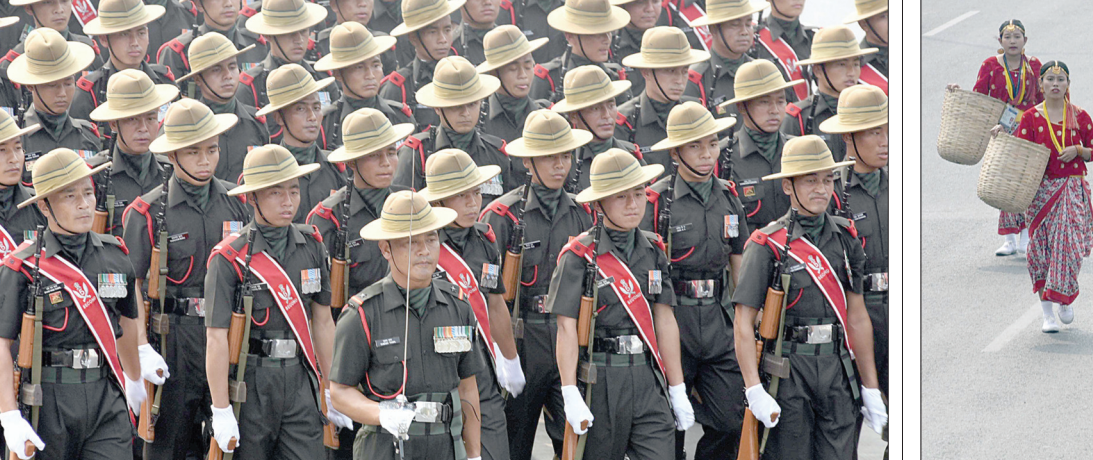
Full dress rehearsal for the Republic Day parade held at Red Road in Kolkata on Friday.

sented on February 1. The Waqf (Amend-ment) Bill, 2024, aims to brating the National Girl Child Day is a reminder to address these challenges by introducing reforms rededicate ourselves tosuch as digitisation, enwards ending gender dishanced audits, improved crimination and providing transparency, and legal every girl with the oppormechanisms to reclaim iltunities she deserves. Taking to X, Kharge legally occupied proper-