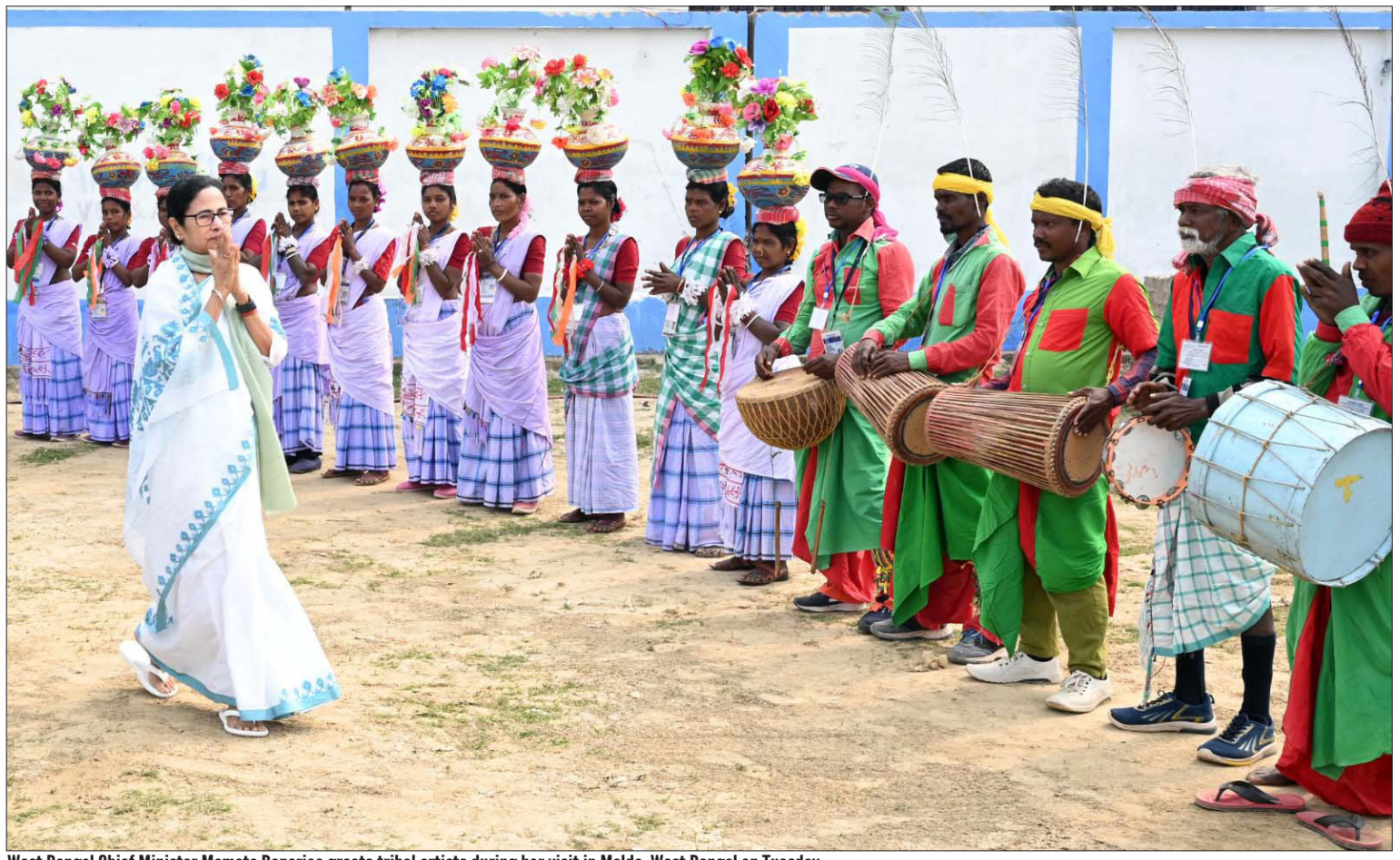
West Bengal Chief Minister Mamata Banerjee greets tribal artists during her visit in Malda, West Bengal on Tuesday