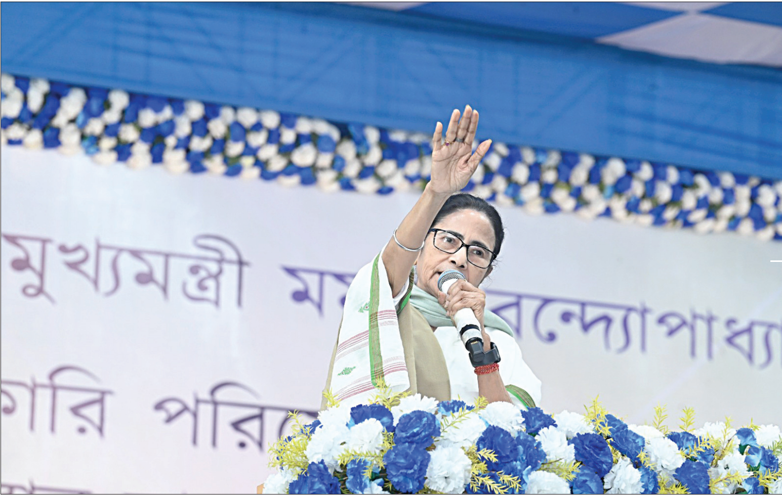
West Bengal Chief Minister Mamata Banerjee at Lalbagh in Murshidabad on Monday.