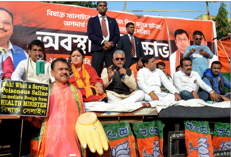
BIP party workers took part in a protest demonstration against the State Government over saline scam and various issues near Swasthya Bhawan in Kolkata on Monday.