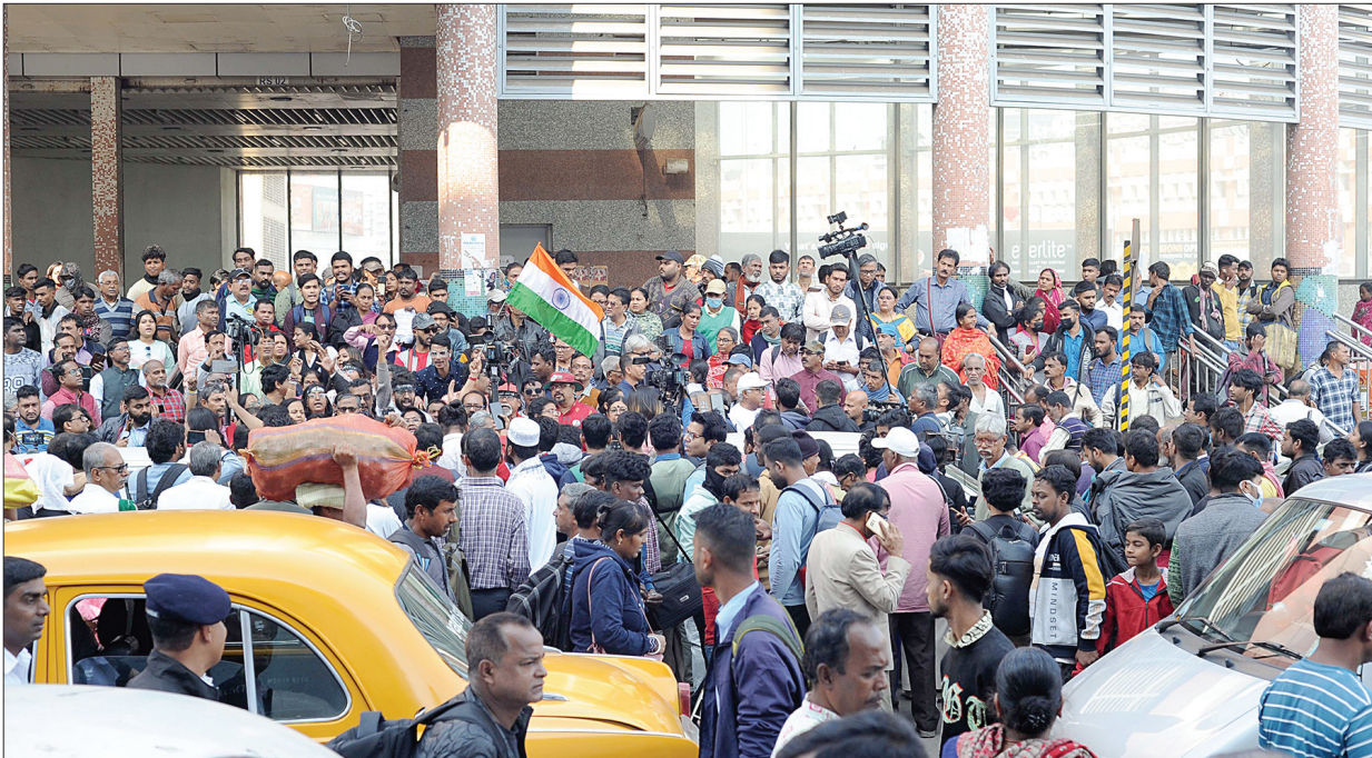
A huge gathering in front of Sealdah Court in Kolkata can be seen on Monday as the verdict came out regarding the rape and murder incident at R G Kar Hospital.