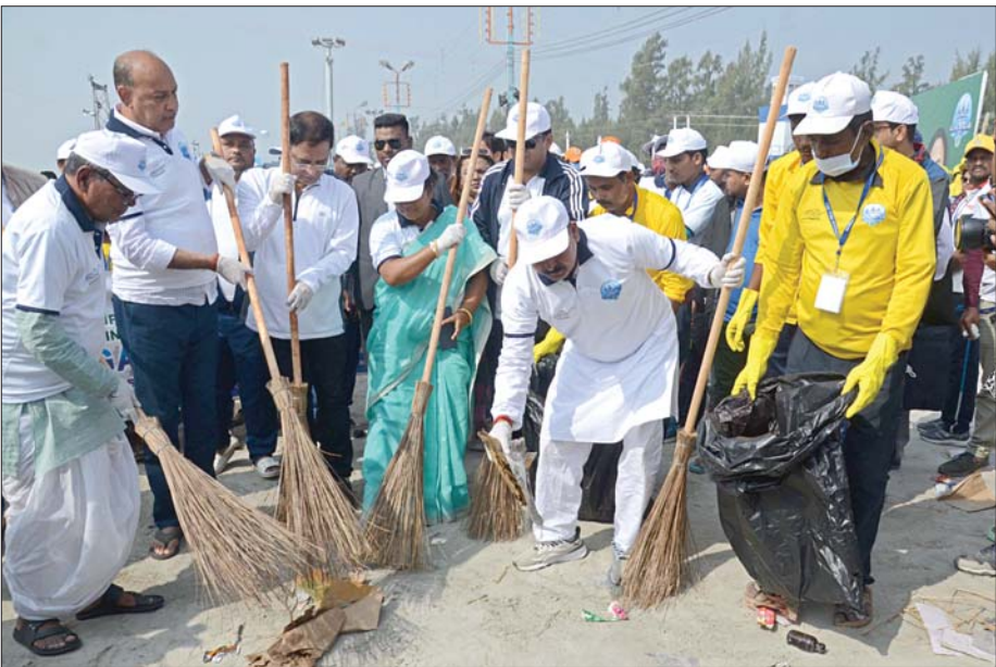
State Minister cleaning the beach following a holy dip, marking the end of the Gangasagar Mela on Gangasagar Island, South 24 Parganas.

reflects that today's India is dynamic, confident and future-ready, he asserted. Modi said, "I compliment every youngster in the startup world and urge more youngsters to pursue this. It's my assurance you won't be disappointed." Meanwhile, the National Startup Day celebrates the transformative role of startups and entrepreneurs in shaping economies and societies. It honours innovation, resilience, and creativity, highlighting the impact of startups in driving technological advancements and sustainable solutions. The day also emphasizes the importance of fostering an ecosystem that nurtures bold ideas and empowers entrepreneurs to challenge the status quo and build the future. Amey Kanekar: Co-Founder of FinRight Launched in 2023, FinRight Technologies, a Mumbai-based fintech founded by professionals from CRED and Amazon, is addressing niche personal finance challenges. Its first focus is Employee Provident Fund (EPF), as this space has become increasingly difficult due to intricate rules, lengthy procedures, and a high rejection rate. FinRight has assisted 5000+ customers on their PF issues, offering a personalised tech-driven and human assistance. FinRight also plans to introduce digital automation to tackle EPF issues by integrating EPFO APIs and AI and launch "Get Your EPF Reviewed" digital service, empowering users to identify EPF discrepancies with just a few clicks.