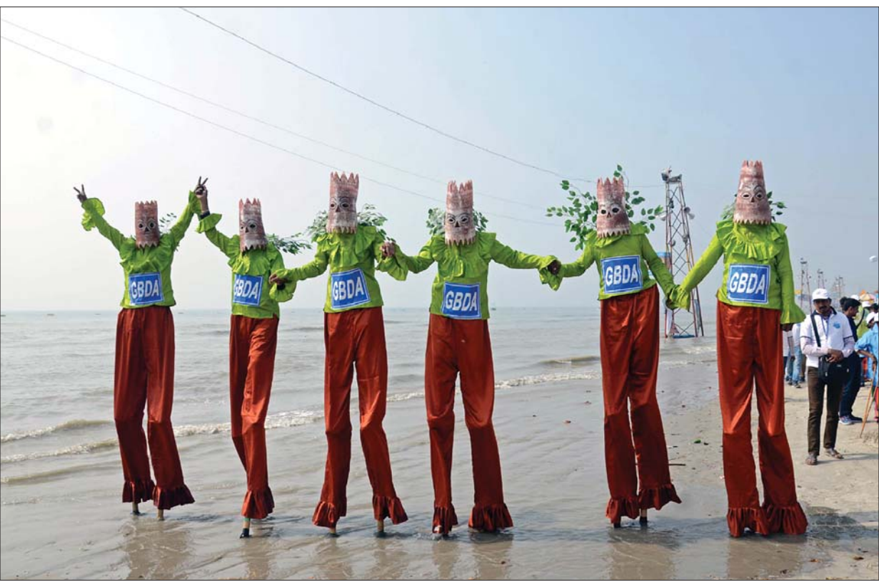
Volunteers launch a green campaign on Gangasagar Island's beach in South 24 Parganas, following the holy dip marking the conclusion of the Gangasagar Mela.

on 16th January 2025 in Kolkata, West Bengal. This workshop is part of an ongoing effort to understand India's climate financing needs and create awareness across stakeholders on the scale of mobilisation needed to accelerate investment in climate resilient development in India.