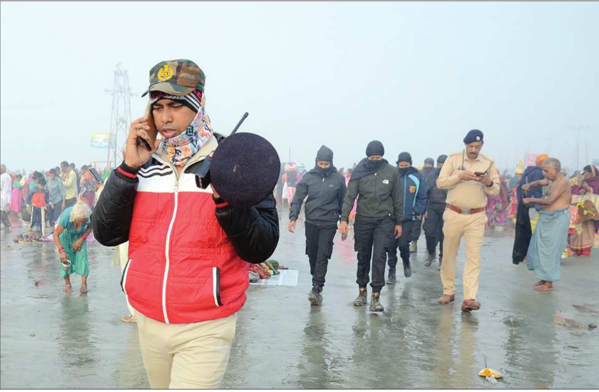
Security personnel at Gangasagar island on the occasion of 'Makar Sankranti' at the Gangasagar island, at South 24 parganas on Monday.

From PG 1 Over 50,000 QR codes are being set up on electricity poles across the 25 sectors of the Maha Kumbh area. These will help pilgrims identify their locations and lodge complaints about electricity-related issues. The cost of helicopter rides for an aerial view of Maha Kumbh has been reduced to 1,296 per person. The 7-8 minute rides, starting January 13, will offer tourists a unique perspective of the expansive Kumbh area and Prayagraj city. Three hospitals have been established at Aurai, Gopiganj, and Unj police stations on National Highway 19 in Bhadohi district for devotees traveling to Maha Kumbh. These facilities will become fully operational on January 14, according to Superintendent of Police Abhimanyu Manglik. NDRF teams and over 10,000 Uttar Pradesh Police's different units have been stationed to ensure the safety of devotees during the Mela period. Traffic police have also devised extensive plans to manage vehicular flow and ensure the safety of devotees attending the Maha Kumbh in Prayagraj from Monday..