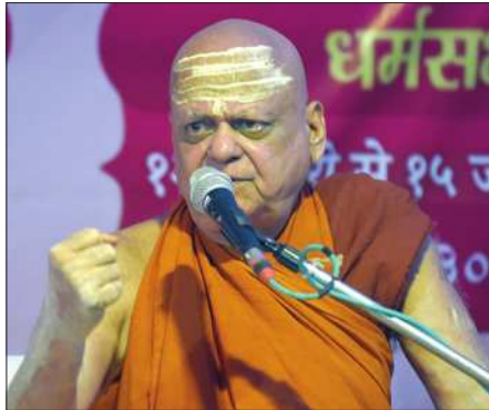
Puri Shankaracharya Swami Nischalananda Saraswati addressing the Press Meet at Gangasagar island on the occasion of 'Makar Sankranti' at the Gangasagar island, at South 24 parganas on Monday.