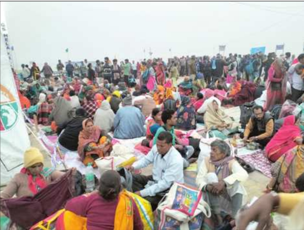
Gangasagar devotees throng at huge numbers at the Gangasagar Mela arena on Monday.