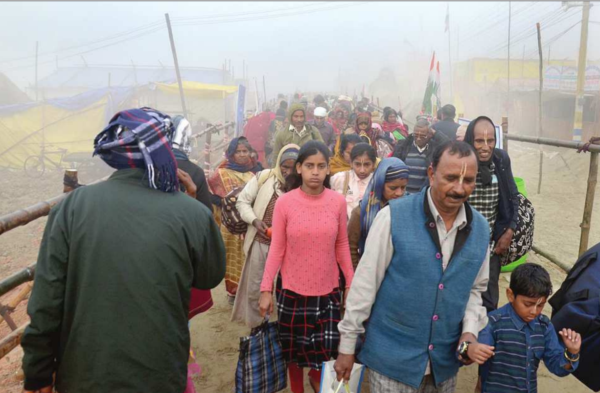
Pilgrims defy all odds including adverse weather to reach at Gangasagar Island in the morning on the occasion of 'Makar Sankranti' at Gangasagar Island, South 24 parganas, West Bengal on Monday.