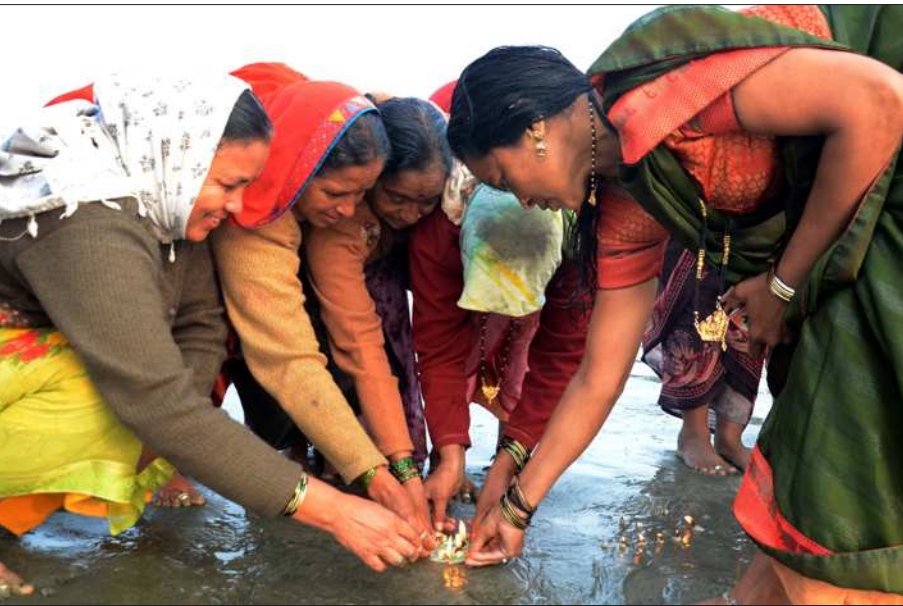
Women Pilgrims perform rituals at Gangasagar island on the occasion of 'Makar Sankranti' at the Gangasagar island, at South 24 parganas on Monday.