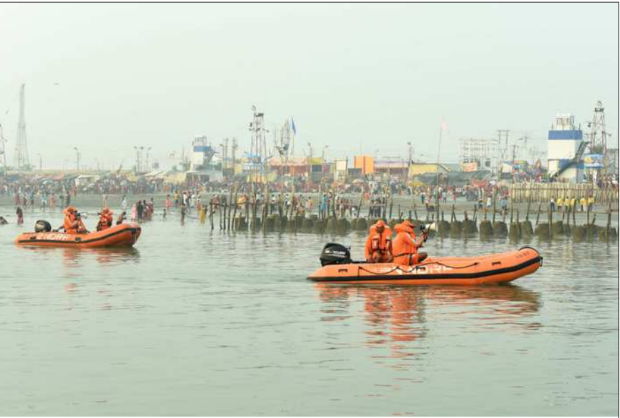
NDRF workers patrolling at Gangasagar island on the occasion of 'Makar Sankranti' at the Gangasagar island, at South 24 parganas on Monday.