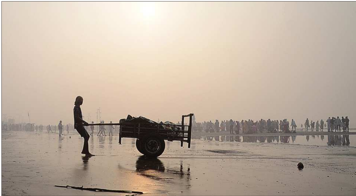
Local people are returning home after fishing at Gangasagar island on a foggy winter morning on the occasion of 'Makar Sankranti' at the Gangasagar island, at South 24 parganas on Monday.