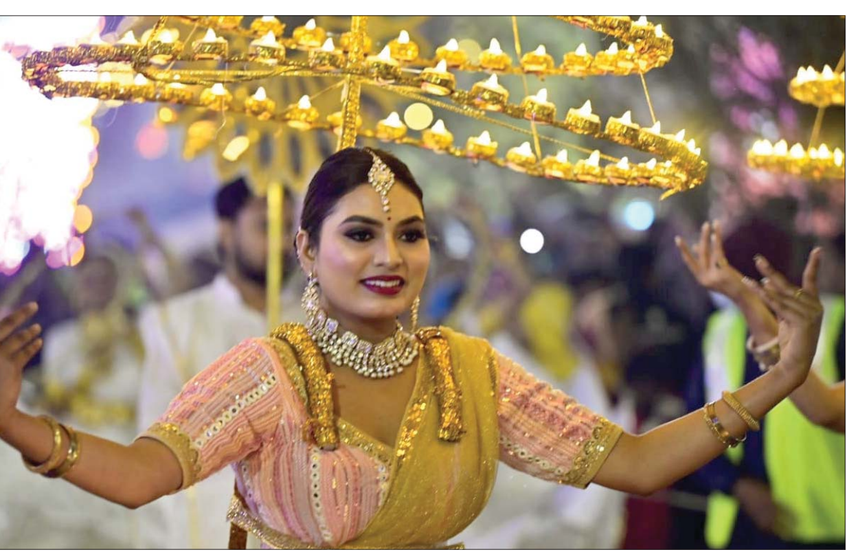
A unique 'Sandhya Arti' is being performed by a professional performer at Gangasagar Mela in South 24 Parganas district on Saturday evening.

He said that his gov-ernment has waged a war against narcotic drugs, while identifying illegal immigrants is required to protect the numerically less indigenous communities.