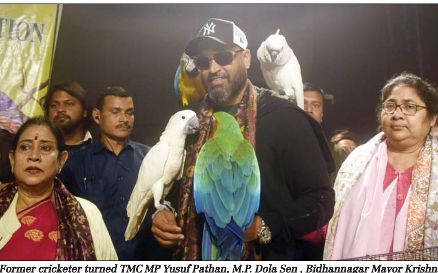
Former cricketer turned TMC MP Yusuf Pathan, M.P. Dola Sen , Bidhannagar Mayor Krishna Chakrabarty during Bengal's Cultural and Nature Festival 2025 at Salt Lake in Kolkata.

tration applications had been filed from single small shops and basements. He also accused the BJP of submitting multiple new voter registration applications using the residential addresses of their leaders. "This is the reality of the biggest political party in India. This is how Prime Minister Modi's party plans to win the elections, ers, including union ministers, for their alleged involvement in the issue.