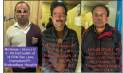
far - 3 people have been arrested. 1.

MI News Service, Hooghly: For re-verification of documents submitted by 83 different applicants for the purpose of issuance of passport, verification is being done from Chandannagar PC that the documents attached with the passport application are fake. On this issue a case was registered under Bhadreswar P.S. The number of passports involved is 83 No number of arrests so