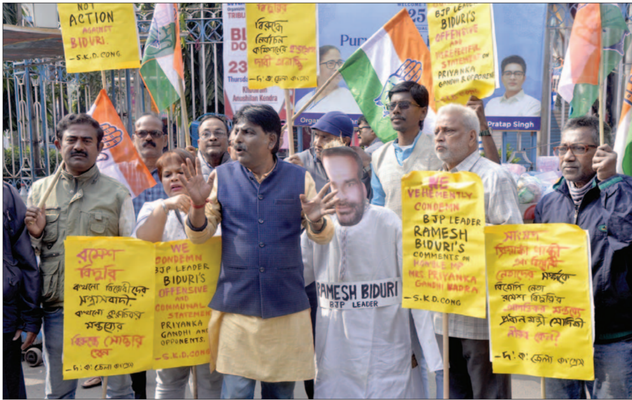
Congress activists took part in a demonstration to protest against BJP leader Ramesh Biduri's comment on Priyanka Gandhi, in Kolkata on Thursday.

The additional time, he said, would allow the college to complete the syllabus effectively and ensure that all students were adequately prepared for the examination.