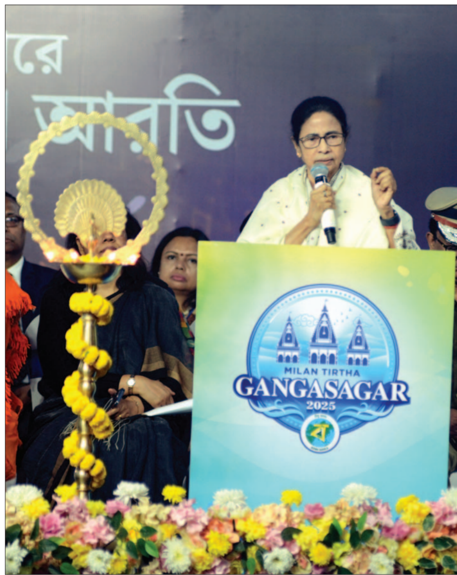
West Bengal Chief Minister Mamata Banerjee addresses during the inauguration of Babughat transit camp in Kolkata on Thursday.

"Many of us have been members of this House before, but that was when Jammu and Kashmir was a state. The system is different today. We need to understand how we are going to work and what the powers of this Assembly are," Abdullah said. The chief minister also said that to familiarise everyone with the procedures of this system, the speaker has organised the orientation programme. "The deputy chairman of Rajya Sabha also participated in this exercise. I believe the experience of the senior members will prove beneficial. In the upcoming sessions, the MLAs will represent the people better and raise their issues effectively," he added. He however, did not provide any clear answer when asked about the possibility of early restoration of the statehood of Jammu and Kashmir and Article 370 by the Union government.