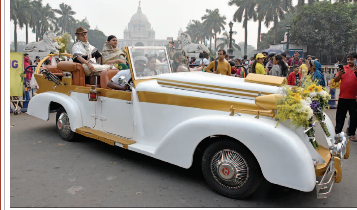
People in a vintage car taking joy ride infront of Victoria Memorial in Kolkata on Sunday.