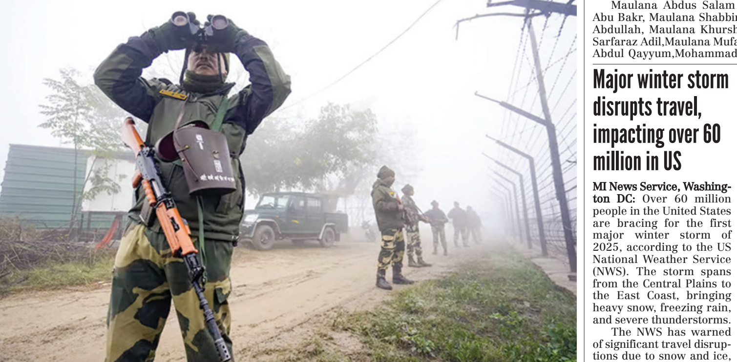
Border Security Force (BSF) personnel stand guard along the India-Pakistan border fence during a cold and foggy winter morning, at Border out Post (BOP) Pulmoran, near Amritsar.

The UN has expressed grave concern over the adoption of the laws, calling on the Israeli government continue to allow