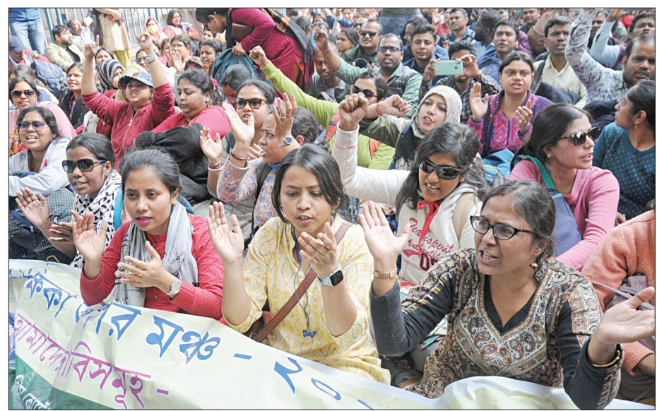
Members of the 'Rightful Teachers' Rights Forum (Jogyo Shikshak Shikshika Adhikar Mancha) associated with the SLST 2016 participate in a protest rally and blocked the road and demand for justice for their permanent job at Salt Lake in Kolkata on Friday.

From PG 1 Survey. According to the survey, rural poverty is estimated at 4.86 per cent in FY24, a sharp decline from 7.2 per cent in FY23 and 25.7 per cent in FY12. Similarly, urban poverty has dropped to 4.09 per cent in FY24, compared to 4.6 per cent in FY23 and 13.7 per cent in FY12. Recently PM Narendra Modi had also said that over 23 crore people have come out of poverty in last ten years. The poverty estimates may undergo minor revisions if the 2021 census is done and updated rural-urban population data is published. However, SBI Research believes that urban poverty levels could decline even further in the coming years. It said "It is possible that these numbers could undergo minor revisions once the 2021 census is completed and new Rural Urban population share is published. We believe Urban poverty could decline even further".