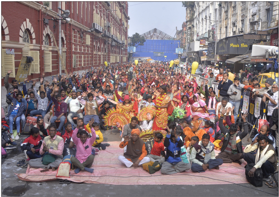
Traditional Purulia Chau artists perform Chau dance during Sara Bangladesh Lokshilpi Samsad protest rally over their various demands for traditional folk performers in Kolkata on Friday.