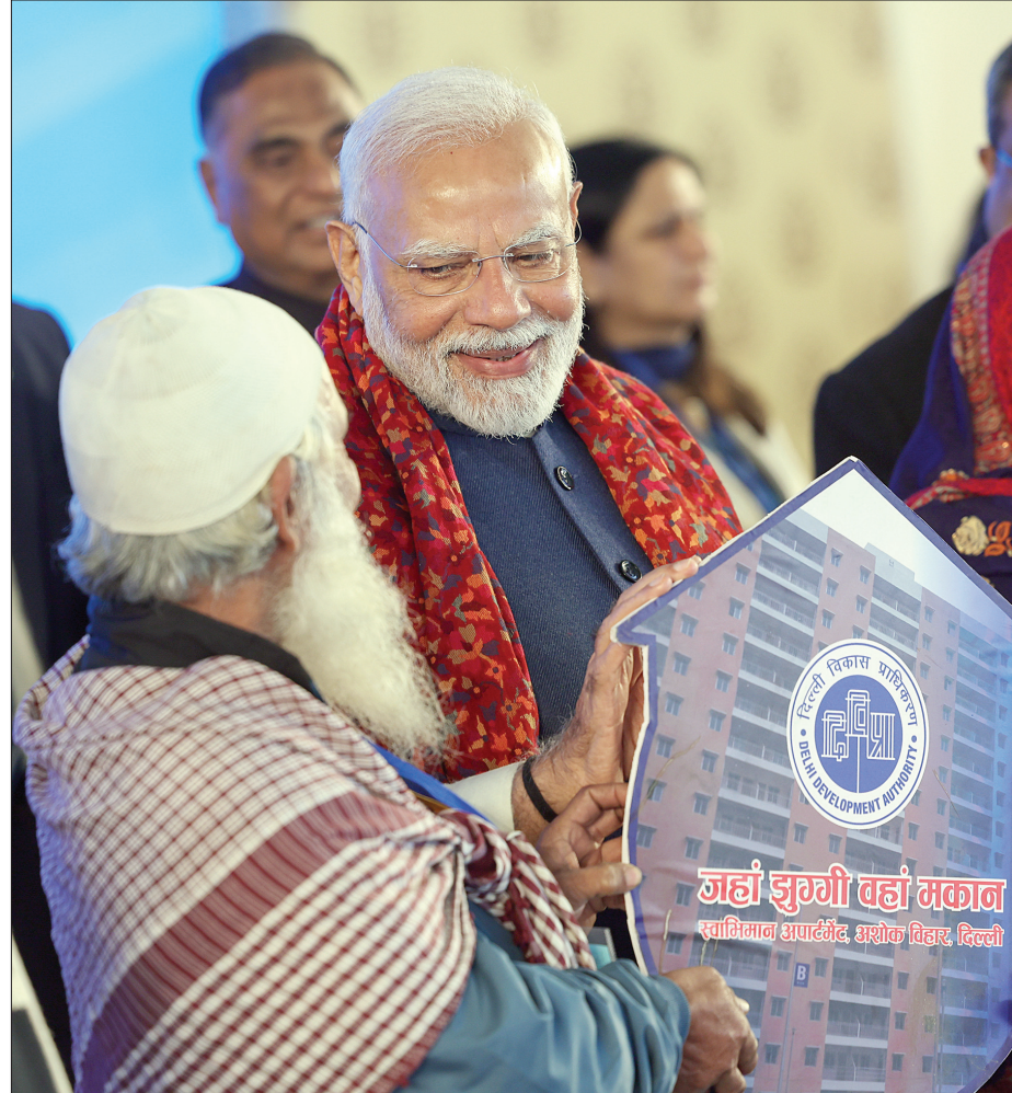
Prime Minister Narendra Modi hands over a symbolic key to a beneficiary during a public meeting to inaugurate and lay the foundation stone of multiple development projects, in New Delhi on Friday.

Former prime minister's wife, Gursharan Kaur sang a 'shabad (verse)' from the Sikh holy scriptures during the 'Akhand path (continuous recitation of Guru Granth Sahib)' at his residence. Singh who breathed his last on December 26 at the age of 92 in a New Delhi hospital, steered the country as prime minister from 2004 to 2014 and was considered the architect of India's economic ►► Continued on page 3