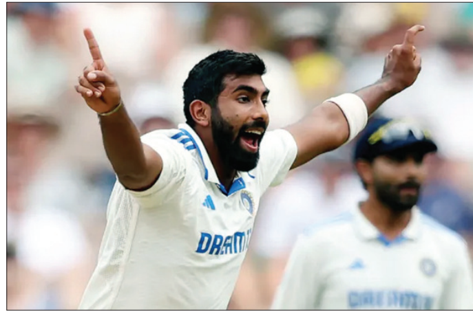
square leg for just three. India was 168/9 in 68.2 overs.

Prasidh Krishna was next to go, dismissed by Starc and caught by Sam Konstas at deep backward