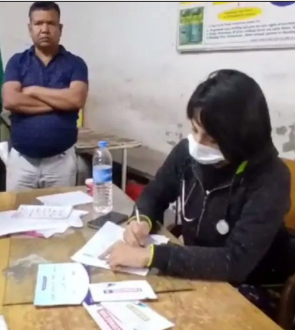
Hospital superintendent on the left, female doctor on the right

ment, he forced her to work in the emergency room. It is also reported that she was forced to work on night duty. When she protested, the hospital superintendent threatened her. When she refused to do night duty, he