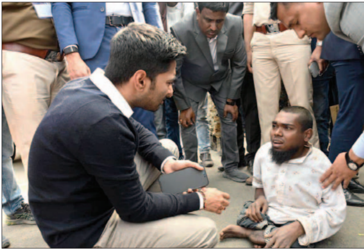
TMC's National General Secretary, Abhishek Banerjee interacts with a physically disabled man during the Sebaashray health camp in Diamond Harbour SDO ground on Thursday.

Along with providing medical services, the camp will also conduct tests and distribute medicines. After inaugurating the camp, Abhishek Banerjee visited the facility and explained that the initiative is a continuation of efforts started in November. In a conference held in Amtala, more than 1,200 doctors from various districts of the state attended, and now the Sebaashray initiative has been launched in Diamond Harbour. Abhishek emphasized that it is the responsibility of elected representatives to ensure the well-being of the people. He recalled that last year, he had announced the dis-