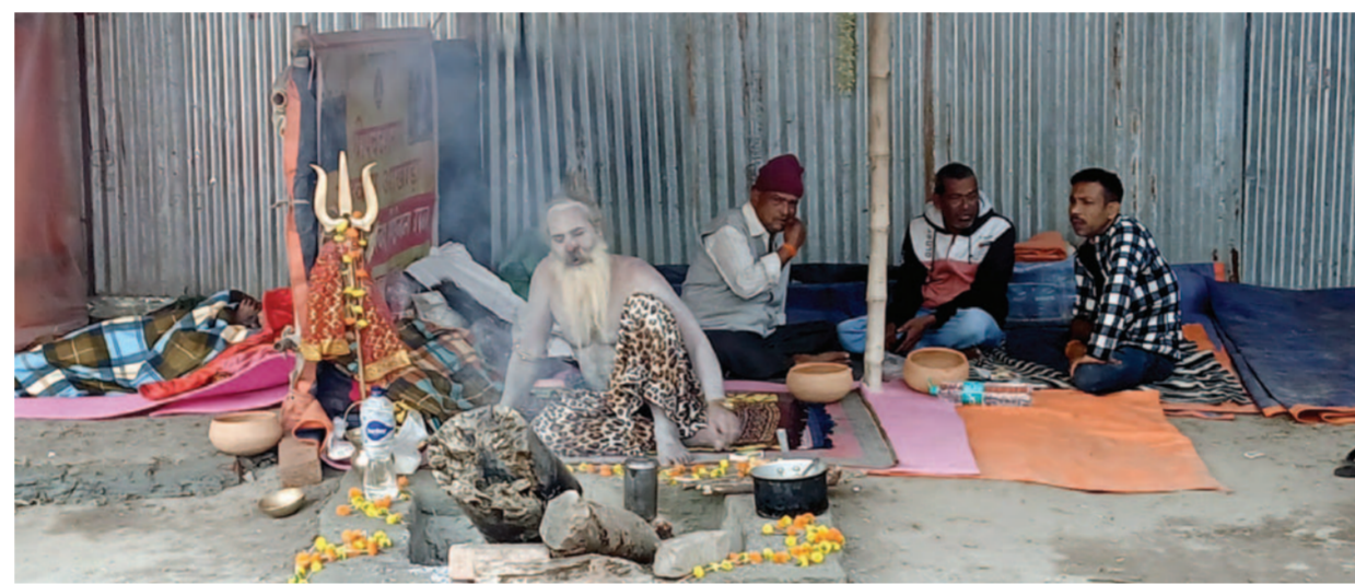
Sadhus at Babughat transit camp ahead of Ganga Sagar Mela in Kolkata

The attack was captured on CCTV footage, though viewers have been advised to use discretion due to the graphic nature of the content. Authorities are investigating the incident and searching for the assailants involved in this tragic attack on a prominent TMC leader.