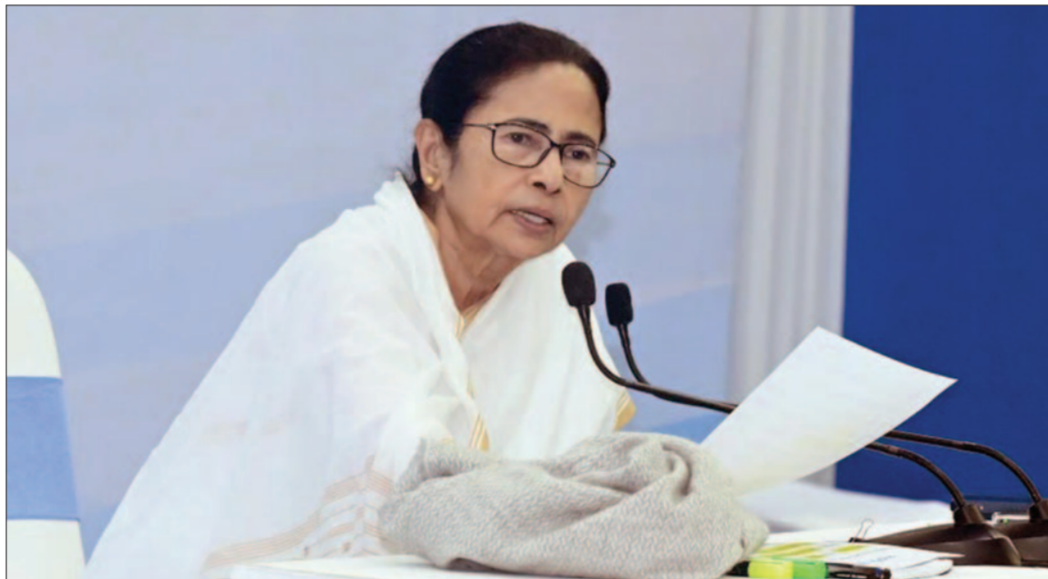
West Bengal Chief Minister Mamata Banerjee addressing an administrative meeting at Nabanna on Thursday.

MI News Service, Kolkata: West Bengal Chief Minister Mamata Banerjee has expressed her strong disapproval over the proposed introduction of a semester system in primary schools, claiming that she was unaware of the policy until she read about it in the media. The Chief Minister publicly reprimanded Education Minister Bratya Basu for implementing a major change in the education system without consulting her.