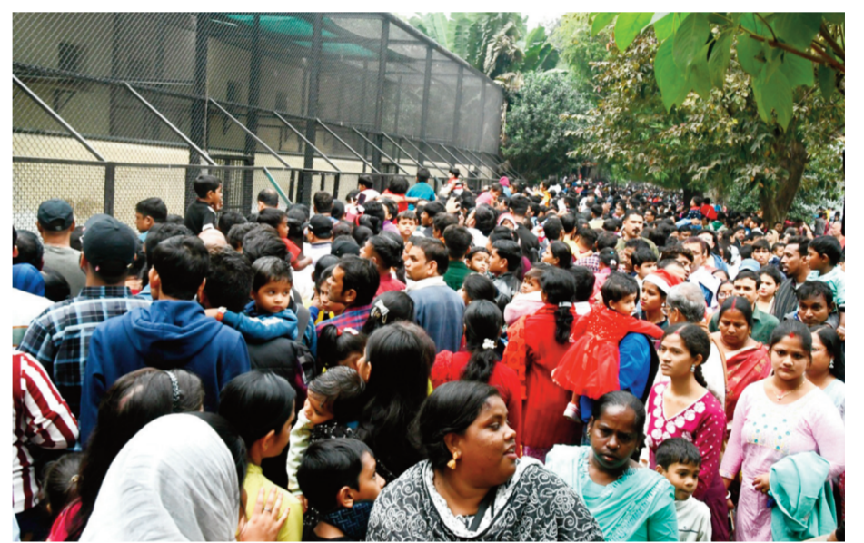
People visit Alipore Zoological Garden on the eve of New Year in Kolkata.

The significance of Kalpataru Utsav lies in the belief that wishes made with a pure heart on this day are fulfilled. This faith brings devotees in droves to seek blessings and divine grace from Sri Ramakrishna. From that day onward, January 1 has been observed as Kalpataru Utsav at Kashipur Udyanbati and Dakshineswar, commemorating Sri Ramakrishna's blessings and his divine manifestation. This year's Kalpataru Utsav saw fervent participation from devotees across the state. Rituals and offerings began early in the morning, creating an atmosphere of devotion and joy. Priests performed special pujas, while scholars and monks reflected on Sri Ramakrishna's teachings. Temples like Belur Math, Kalighat, and Tarapith also attracted thousands of devotees seeking spiritual solace and blessings. The event not only marks the spiritual significance of Sri Ramakrishna's teachings but also celebrates the unity of faith and devotion. On the occasion of the New Year, a large crowd of devotees also gathered at Tarapith to offer prayers to the goddess, wishing for a prosperous year ahead. Since Wednesday morning, the devotees have been seeking the goddess's blessings, hoping that the New Year brings good fortune. Many are also visiting the renowned Kankalita temple in the district, offering prayers to fulfill their desires.