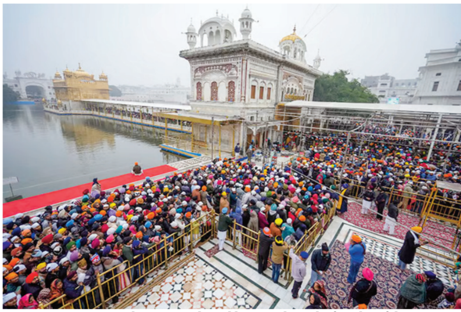
Devotees arrive to pay obeisance at the Golden Temple on the first day of the year 2025, in Amritsar.

MI News Service, New Delhi: The Reserve Bank allowed prepaid payment instruments holders to make and receive UPI payments through third-party mobile applications. It has been decided to enable Unified Payments Interface (UPI) payments from/to full-KYC prepaid payment instruments (PPIs) through third-party UPI applications, the central bank said in circular. "A PPI issuer shall enable holders of only its full-KYC PPIs to make UPI payments by linking its customer PPIs to its UPI handle. UPI transactions from PPI on the issuer's application shall be authenticated using the customer's existing PPI credentials," it said. Such a transaction will, thus, be pre-approved before it reaches the UPI system. A PPI issuer, in its capacity as a payment system providers, should not on-board customers of any bank or any other PPI issuer, the RBI said. The RBI's decision is aimed at providing more flexibility to holders of PPIs such as gift cards, metro rail cards, and digital wallets, among others. Currently, UPI payments from/to a bank account can be carried out using the UPI application of that bank or of any third-party application provider. However, UPI payments from/to a PPI can only be carried out using the mobile application provided by the PPI issuer. UPI is an instant real-time payment system developed by National Payments Corporation of India to facilitate inter-bank transactions through mobile phones.