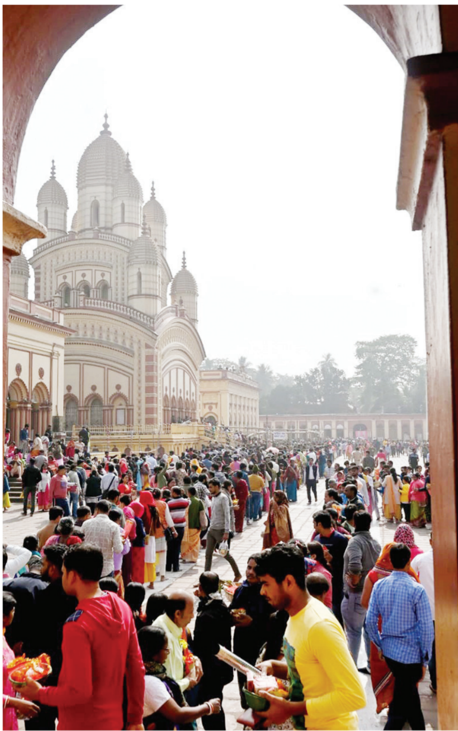
Devotees visit Dakshineswar Kali Temple on the occasion of Kalpataru Utsav, on Wednesday.