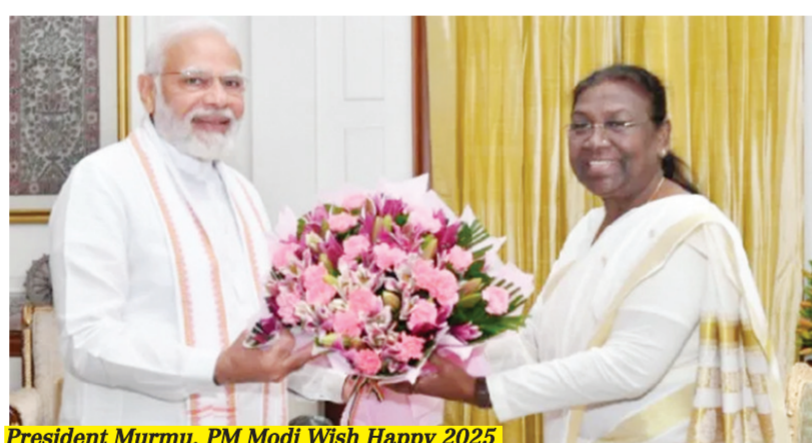
President Murmu, PM Modi Wish Happy 2025

Vice-President Jagdeep Dhanekar said this year marks the nation's entry into the final quarter of our Constitution's centenary and is the time to rededicate ourselves towards realising the vision of our Constitution makers. "Warm greetings to all citizens as we enter 2025 a mo-