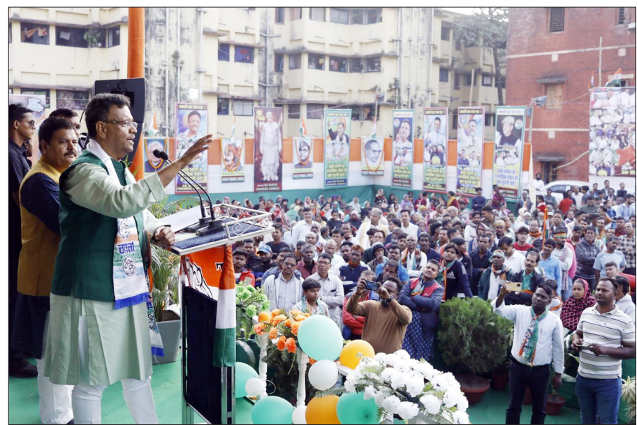
Firhad Hakim as chief guest on occasion of Inaugural Ceremony of 28th Foundation Day of All India Trinamool Congress organised by 80 Block Trinamool Congress at Taratala New CPT Colony, Kolkata 88 on January 1st, 2025.