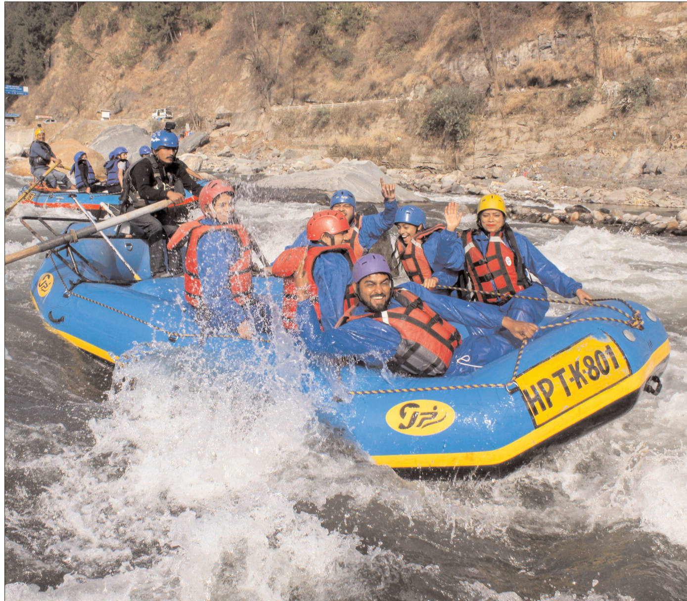
Tourists enjoy rafting in the Beas river on New Year's Day, in Manali on Wednesday.

References: 1. JAMA Cardiology Study 2. Ritucharya in Ayurveda 3. Harvard Medical School Study on Winter Heart Attacks 4. JAPI Study on Ayurveda and Diabetes 5. European Society of Cardiology Study