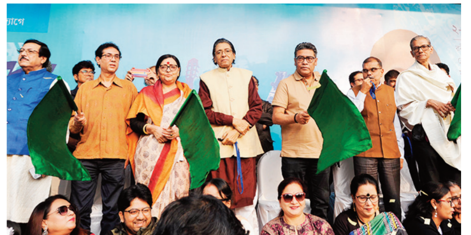
Indranil Sen, State Minister for Tourism and Technical Education, Training & Skill Development and MOS, Information and Cultural Affairs Departments, flags off the curtain raiser of Bangla Sangeet Mela 2024-25 in presence of eminent personalities at Rabindra Sadan Premises in Kolkata on Wednesday.

After the curtain-raiser ceremony, Indranil Sen addressed a press conference, crediting Mamata Banerjee for making the event possi-