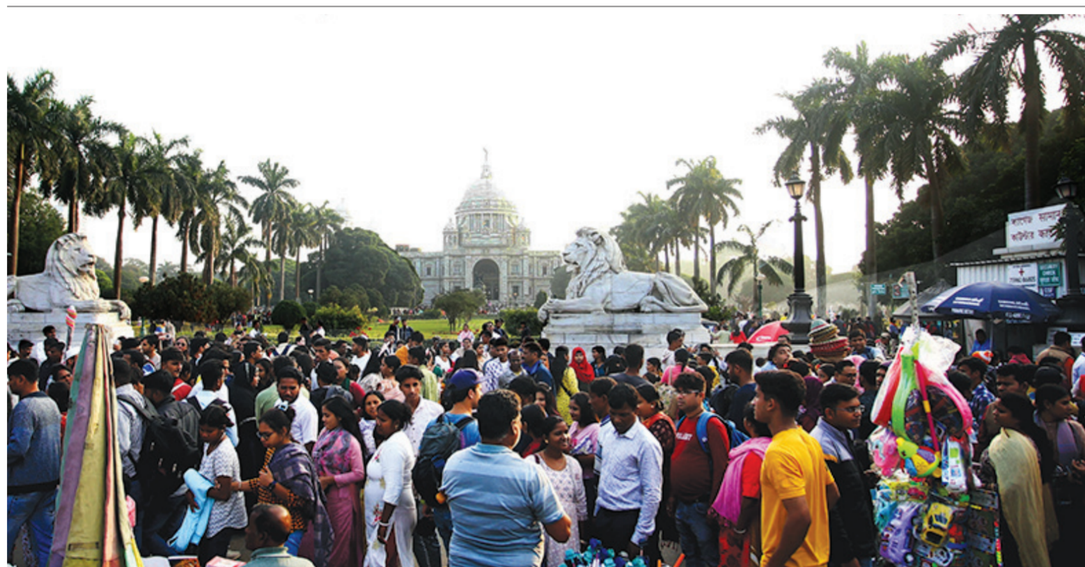
People visited Victoria Memorial on the first day of Year 2025 in Kolkata on Wednesday.

He further stated, "Each new year brings an opportunity to start afresh, to chart a path guided by courage, compassion, and purpose. Let this year inspire us to rise above challenges, foster harmony, and work hand in hand towards a brighter future for all. May we find strength in unity, kindness in our hearts, and resilience in the face of every trial. Here's to a year filled with meaningful progress, shared joy, and abundant opportunities. Wishing you all a Happy and Prosperous New Year 2025"