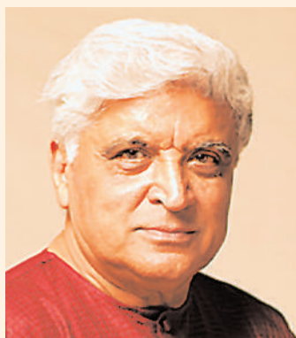
JAVED AKHTAR LYRICIST, WRITER

“ WE LOVE MOVIES, WHETHER IT IS FROM NORTH, SOUTH, EAST OR WEST. STORIES ARE IN OUR DNA. IT'S IN OUR DNA TO LISTEN AND TO TELL STORIES. SO WE SHOULD RESPECT INDIAN FILMS. INDIAN CINEMA "ONE OF THE STRONGEST GOODWILL AMBASSADORS IN THE WORLD.