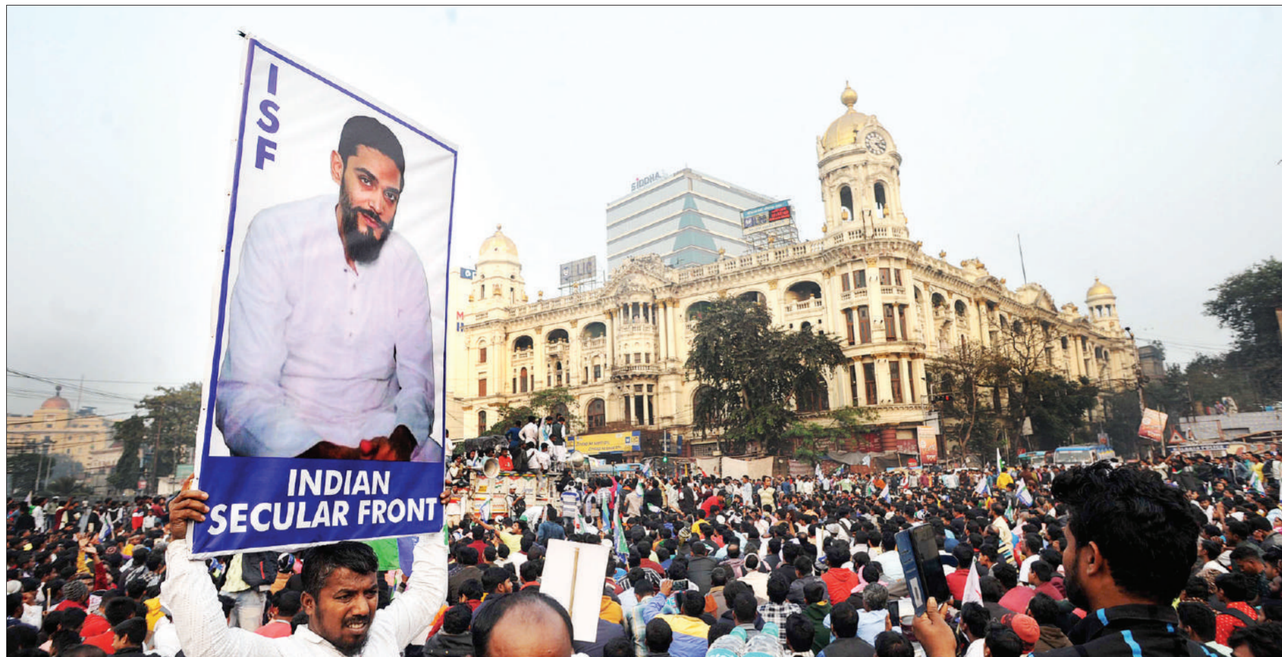
ISF, at Esplanade meeting on Saturday.