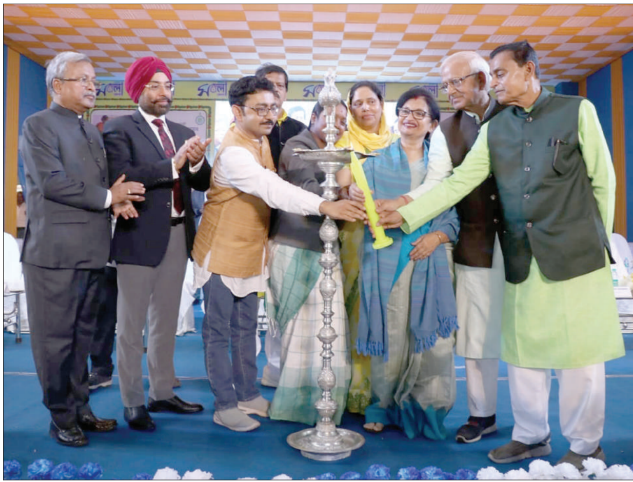
Sabala Mela inauguration at New Town fair ground on Saturday.