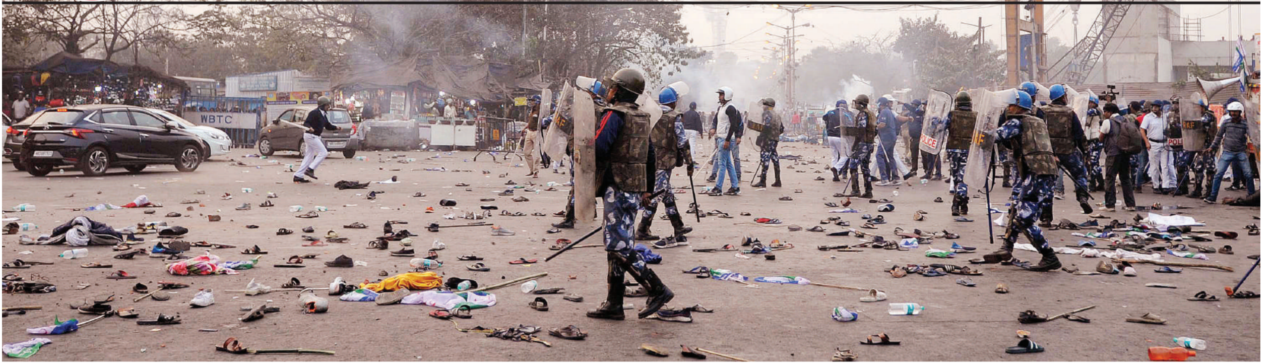
A pitch battle broke out at Esplanade at the foundation day programme of ISF on Saturday at R R Avenue. Police lathi charged the mob and burst tear gas shells. However, police denied the allegation of lathi charge. A member of ISF told police attacked them without any provocation. Earlier in the day a clash broke out between the supporters of ISF and Trinamul Congress at Bhanagar in South 24 Parganas. In both the incidents a number of people including some police personnel were injured.